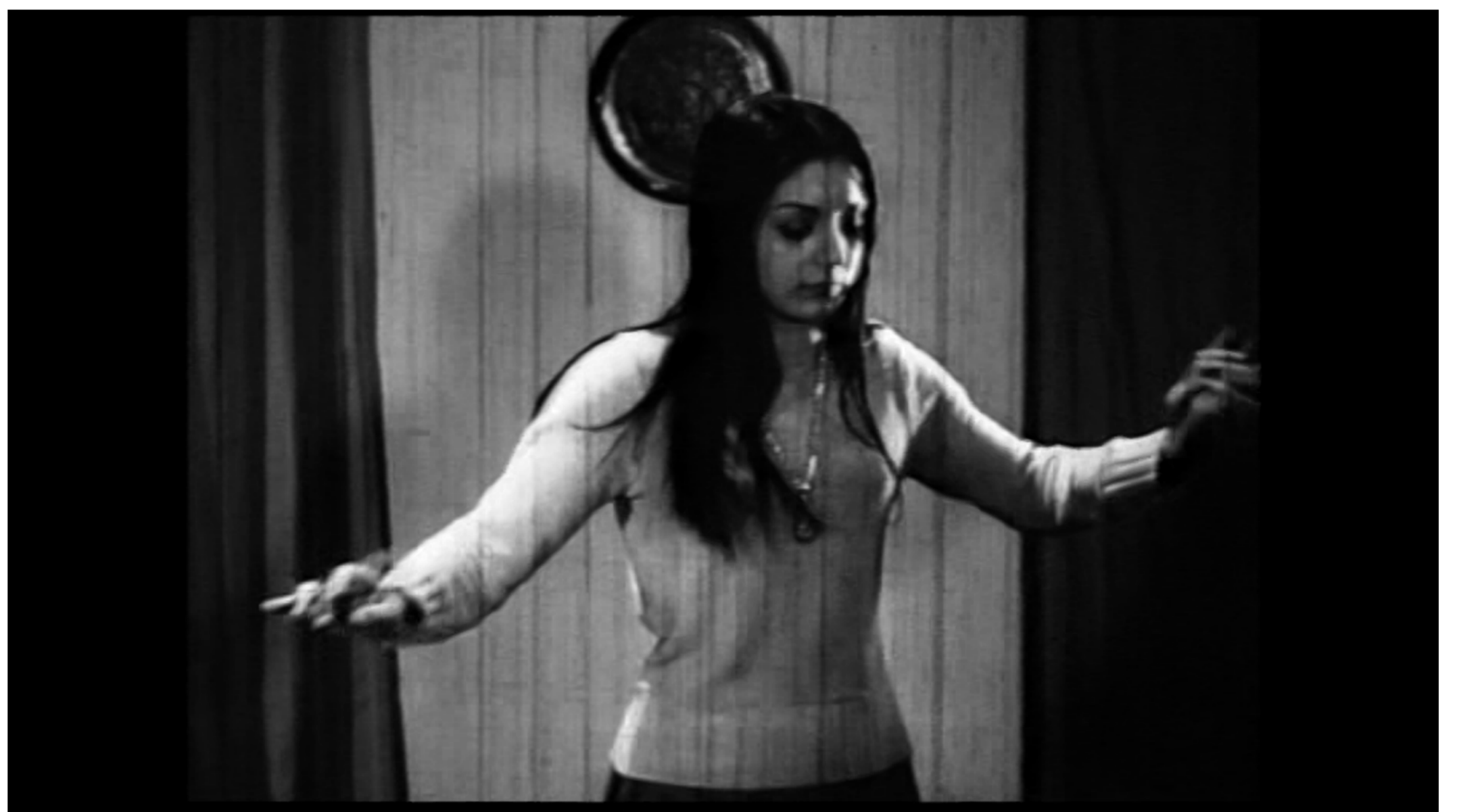
Stills of Googoosh from Retaliation by Nezam Fatemi / 1971

These stills from old movies and TV programs are some examples of the different archive I used in my research on Persian dance and the Iranian popular culture. The movement vocabulary present in these archives, has informed some of the choreographic material in the current piece.