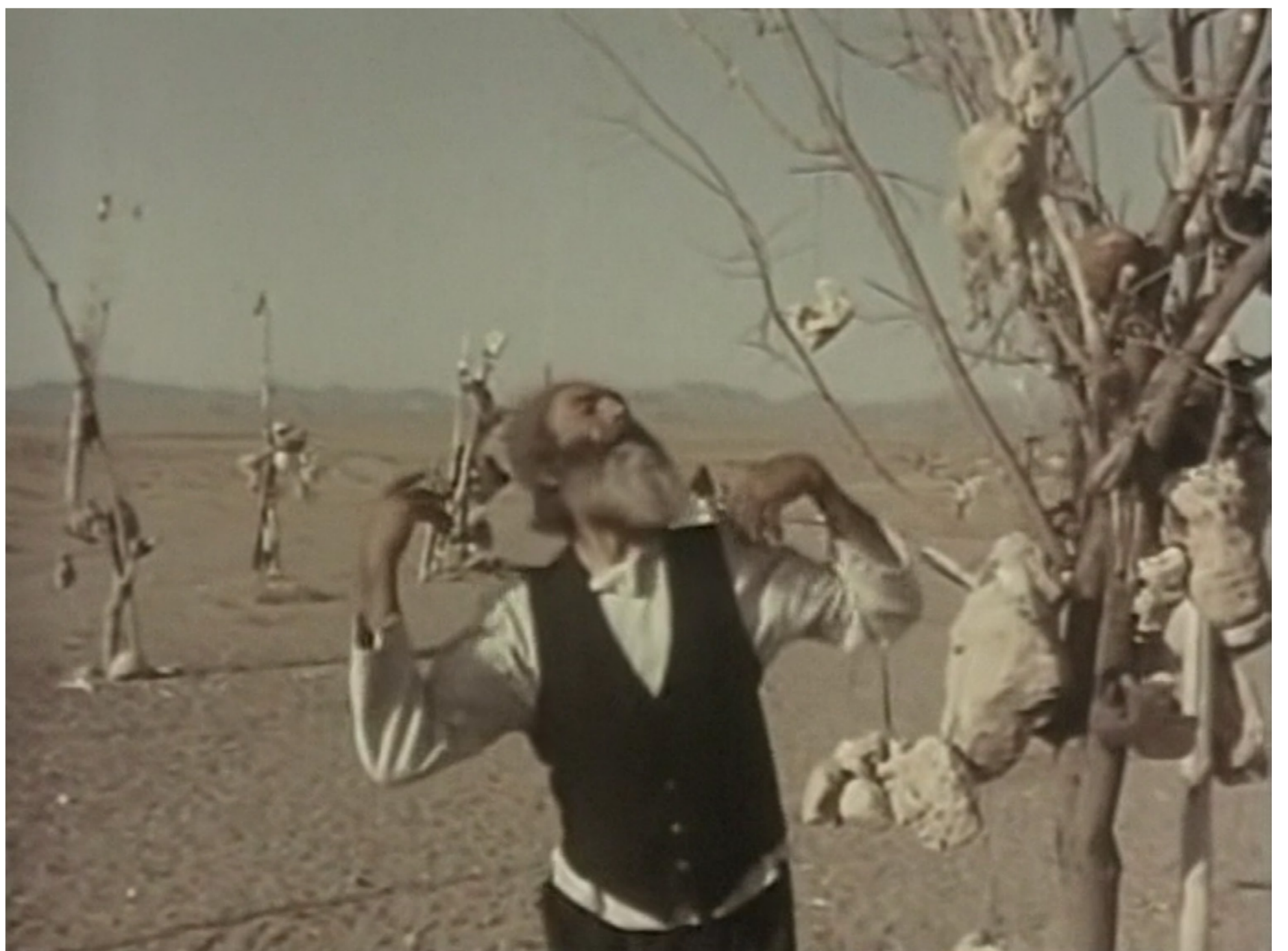
Stills of Darvish Khan from The Garden of Stones by Parviz Kimiavi / 1976