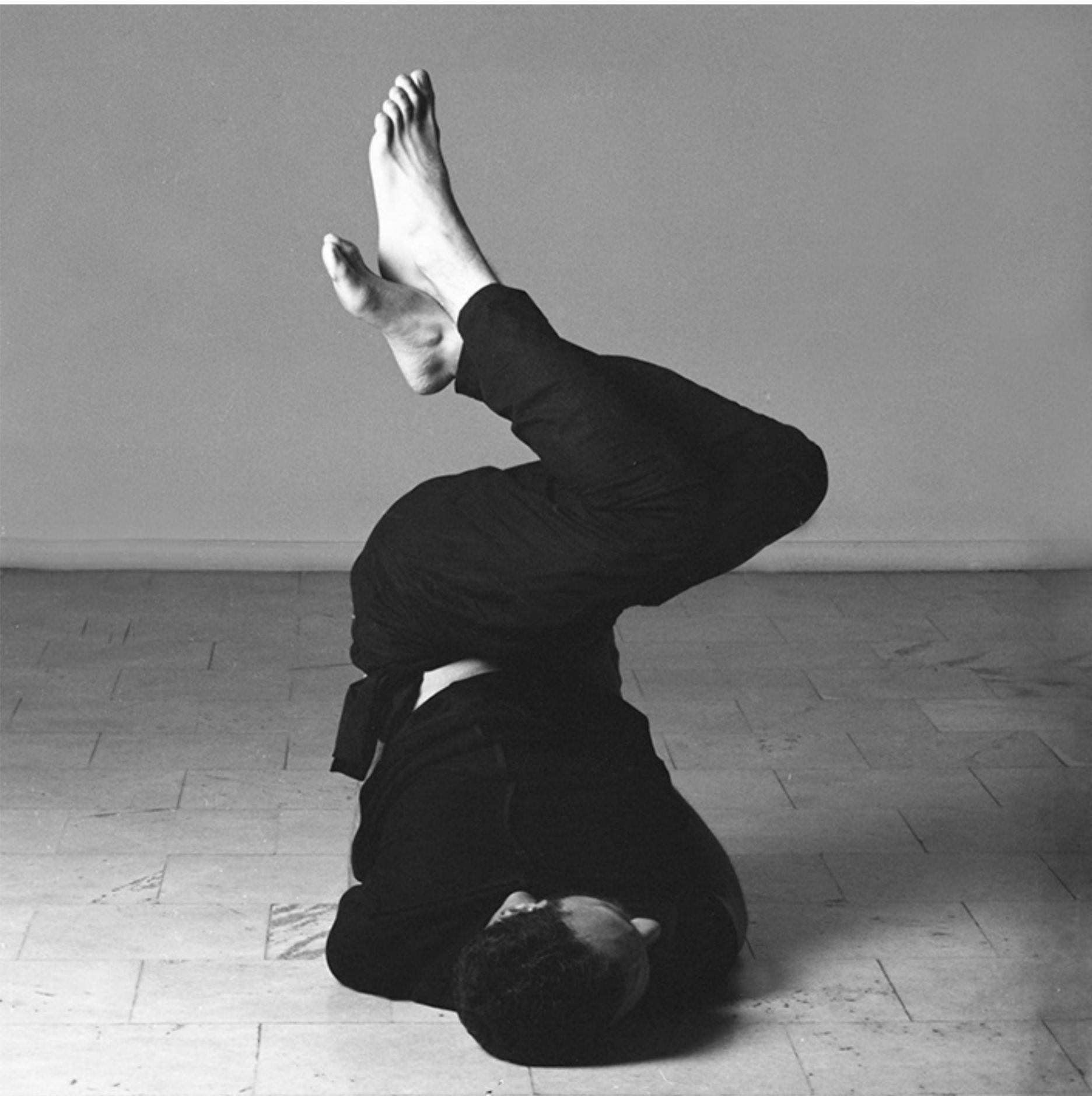
Stills from a photoshoot in Tehran by Kimia Rahgozar / 2016